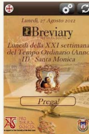
Free Liturgy of the Hours for phone/tablet

This is the one used by Saint Leo Abbey monks.