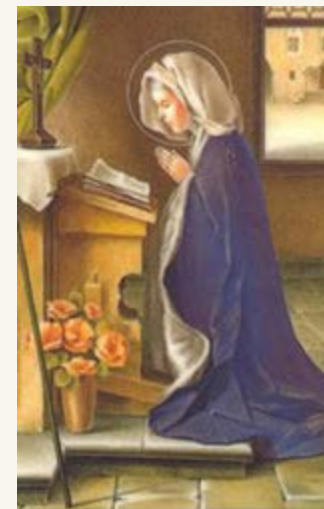
St. Gertrude the Great

This is the one used by Saint Leo Abbey monks.