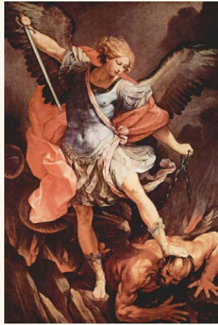
Apostolic letter to read for Jan. 4