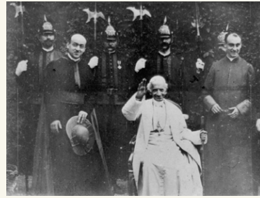
Consecrated Life Private Facebook Page