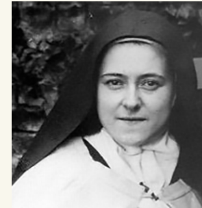
Announcement of Year of Consecrated Life

The above three pictures from left to right are Guido Reni's Michael (in Santa Maria della Concezione church, Rome, 1636) tramples Satan. A mosaic of the same painting decorates St. Michael's Altar in St. Peter's Basilica; Pope Leo XIII who was Pope when Saint Leo Abbey began; and Saint Thérèse of Lisieux or Saint Thérèse of the Child Jesus and the Holy Face, O.C.D., was a French Discalced Carmelite nun.