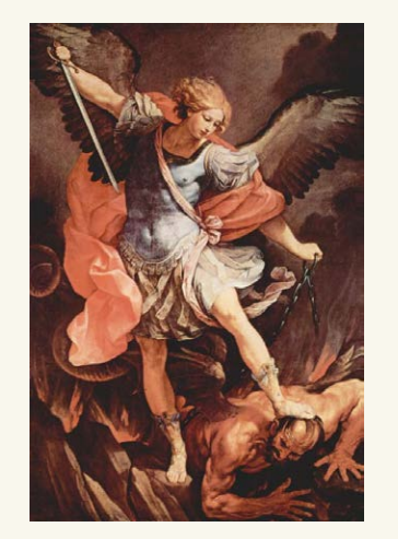
Apostolic letter to read for Jan. 4