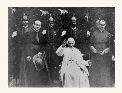
Consecrated Life Private Facebook Page